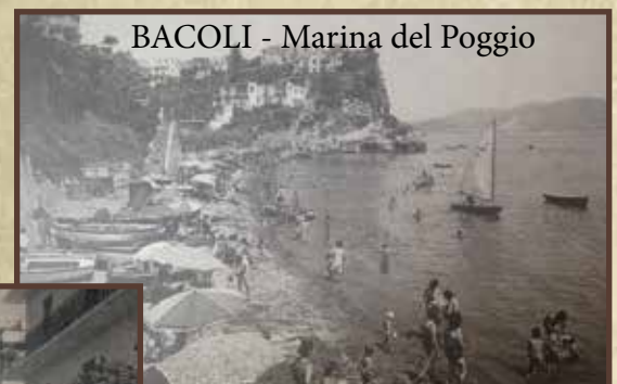
BACOLI - Marina del Poggio