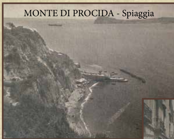
MONTE DI PROCIDA - Spiaggia

Vincenzo Schiano born in Monte Di Procida, Italy.