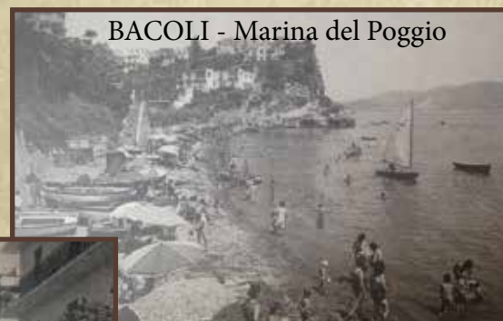
BACOLI - Marina del Poggio